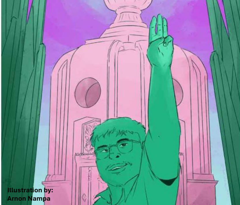
Illustration by: Arnon Nampa