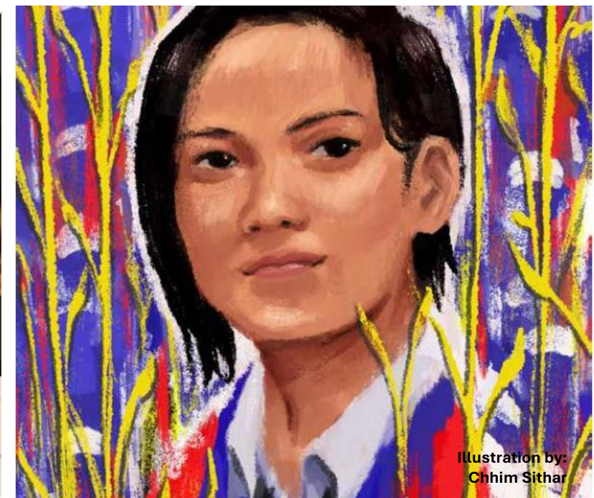
Illustration by: Chhim Sithar