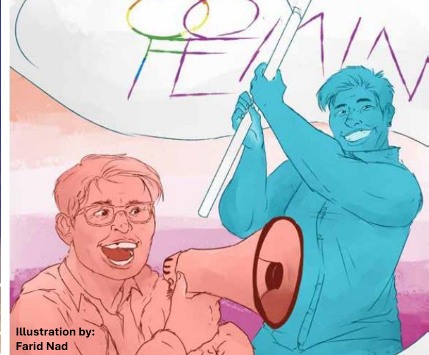
Illustration by: Farid Nad