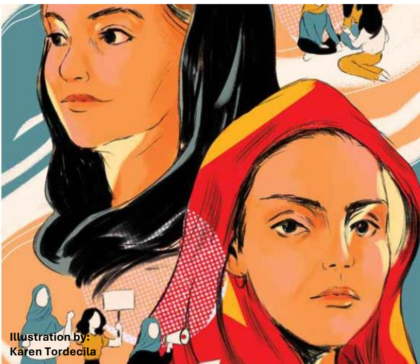
Illustration by: Karen Tordecila