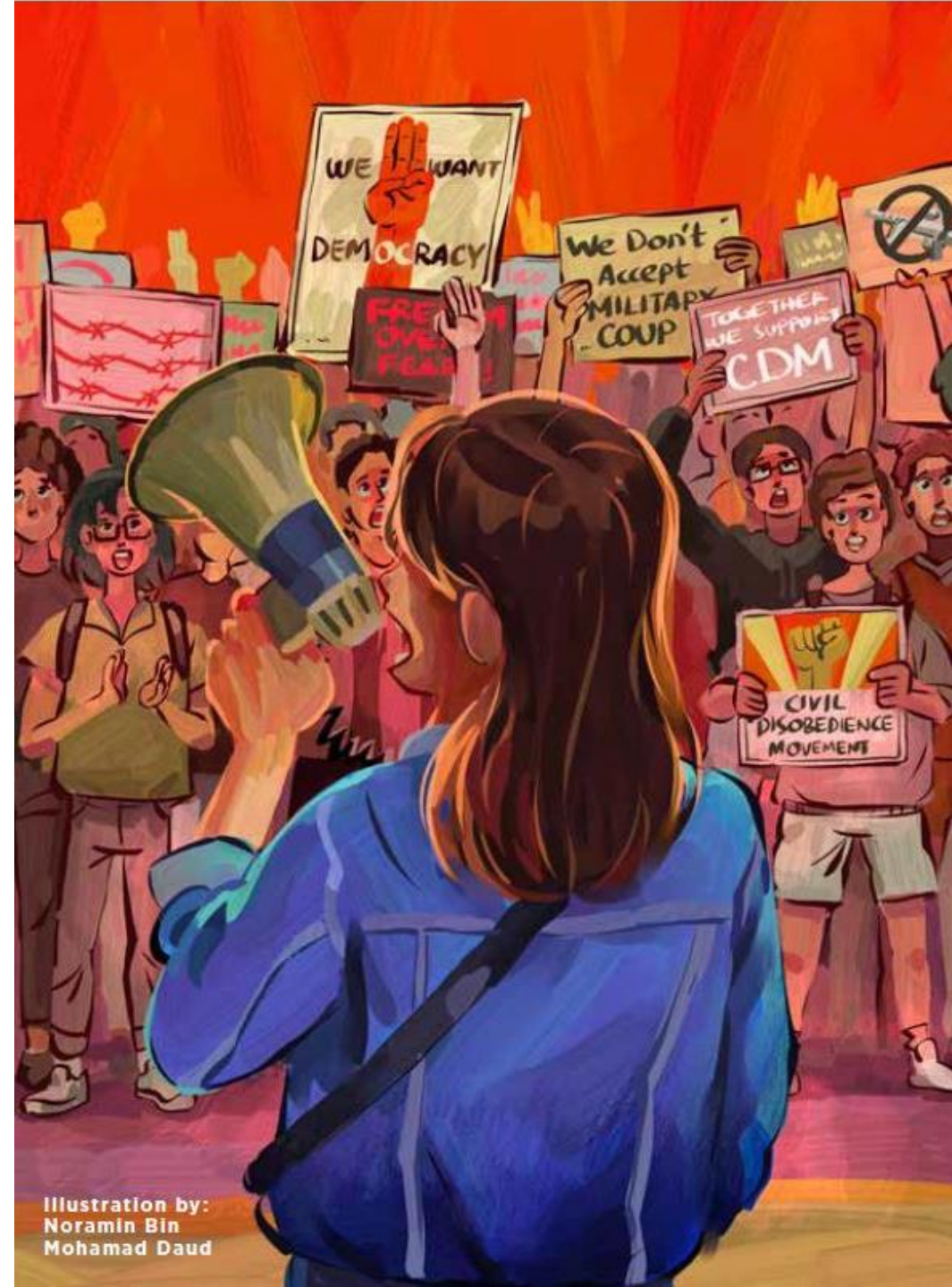
Illustration by: Noramin Bin Mohamad Daud